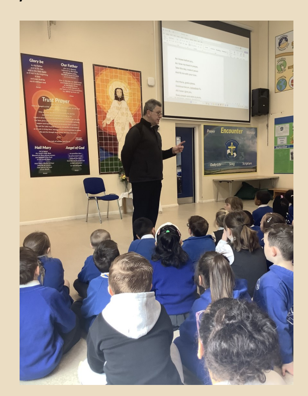
The Crowning of Mary