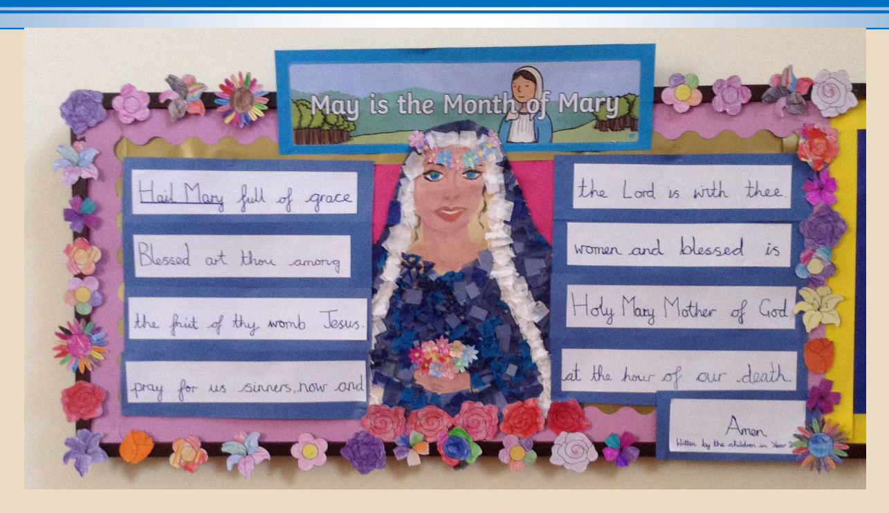
Year 2 display in Church