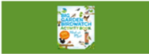
RSPB Big Garden Birdwatch Activity Book By RSPB

Our Pick of the Best Children's Books this January. |