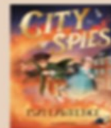
City of Spies By Izzi Lawrence

A fictional book that brings factual events to life! Encourage the children to learn about History and develop their reading too!