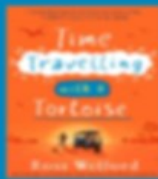
Time Travelling with a Tortoise By Ross Welford

Out in paperback on 4th January. 5+ A beautifully illustrated, lyrical invitation to connect with the natural world